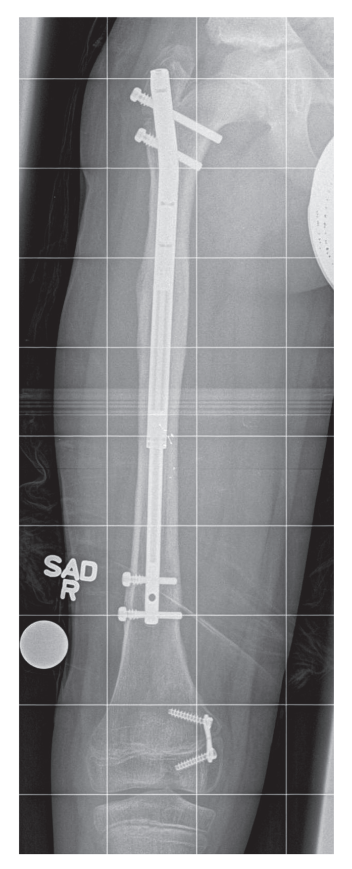
FIGURE 1 Anteroposterior view of the same patient after lengthening with the PRECICE. (Reprinted with permission.).