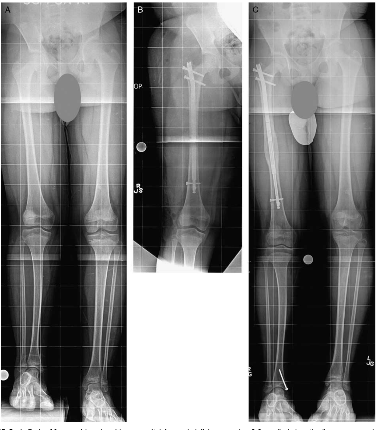
FIGURE 2. A–C, An 11-year-old male with congenital femoral deficiency and a 5.5-cm limb length discrepancy underwent intramedullary nail lengthening. Preoperative anteroposterior (AP) radiograph with a 5-cm lift (A), AP radiograph immediately after nail insertion (B), AP radiograph after complete consolidation (C)

during the distraction phase and every month during the consolidation phase. Radiographs were taken regularly that included both anteroposterior (AP) and lateral views of the femur and, if necessary, long AP films of the lower extremities to assess the limb length discrepancy (LLD) and limb alignment. Patients were prescribed 1000 mg of