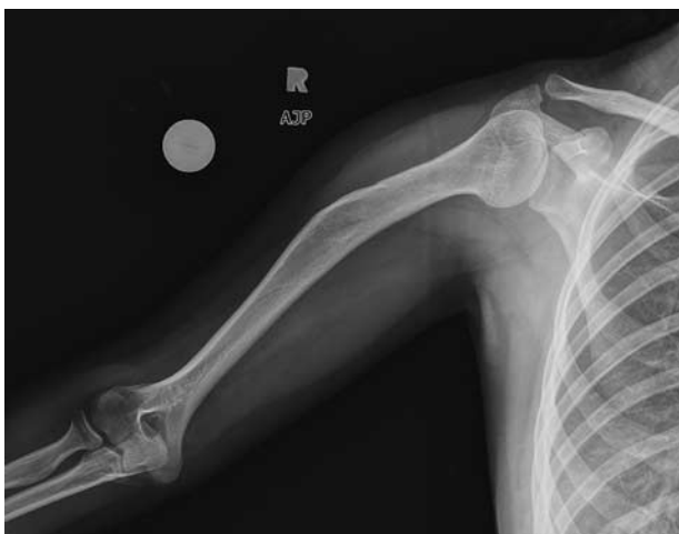
FIGURE 2. Preoperative anteroposterior radiograph demonstrating midshaft varus deformity and varus orientation of the humeral head/neck.

femoral nail (PRECICE; Ellipse Technologies, Irvine, CA) was passed to a point just proximal to the previously drilled vent holes. The osteotomy was completed with an osteotome. The nail was advanced across the osteotomy acutely correcting the angular deformity (Fig. 3). The nail was locked proximally with two 5-mm screws using the guide arm. Distally, after localizing each distal locking hole, the image intensifier was moved (rather than the arm to avoid malrotation deformity) until a perfect circle was seen. The center of the hole was identified with a wire on the skin. The skin was incised and blunt dissection carried down to the bone to avoid injury to the neurovascular structures. Anteroposterior and lateral-medial locking bolts were