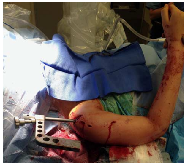
FIGURE 3. Intraoperative view of the arm after osteotomy, insertion of nail, and proximal locking.