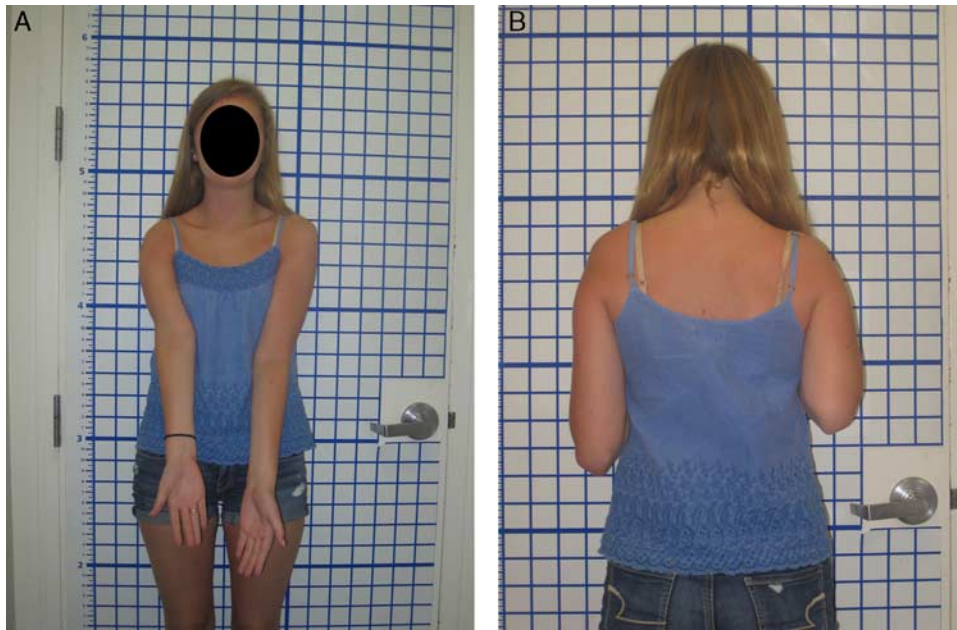
FIGURE 1. Preoperative (A) front and (B) back views demonstrating humeral shortening and full elbow range of motion.