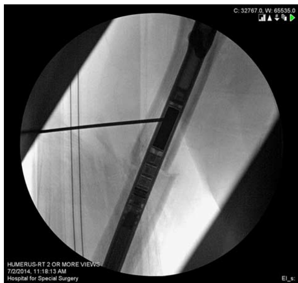
FIGURE 4. Fluoroscopic identification of the internal magnet is used to mark the skin where the external remote controller is to be used.

placed. The position of the magnet was marked on the skin (Fig. 4). Wounds were irrigated and closed in layers.