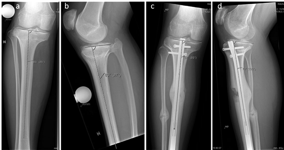
Figure 3. 30-year-old man with 35 mm of tibial shortening due to traumatic injury to the proximal tibial growth plate in childhood. Furthermore, the patient had a symptomatic high-riding fibular head (a). Initial PPTA was slightly below normal (b). The patient was lengthened with a tibia Precice® nail. The fibula was osteomized, but transfixation was done only between the tibia and fibula distally to the osteotomy. This resulted in some lengthening of the fibula as well as an intended distalization of the fibular head (c). However, PPTA increased slightly from preoperatively, which was not intended (d). Delayed healing of the regenerate anteriorly (d). However, there was solid callus on 3 cortices (c, d).