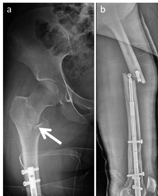
Figure 5. A 24-year-old woman who was lengthened 30 mm for idiopathic LLD with a retrograde lengthening nail. After consolidation of the regenerate she fell from a bicycle, sustaining a pertrochanteric femoral fracture (a). A 16-year-old girl with CFD, who underwent 40 mm of lengthening and correction of a valgus deformity with a retrograde lengthening nail. After consolidation of the regenerate she fell 2 m in a waterfall, sustaining a femoral fracture and breakage of the nail at the level of a locking bolt (b).