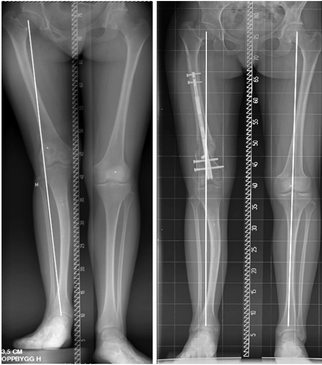
Figure 1. 20-year-old woman with CFD and fibular hemimelia. Initial shortening and valgus in the femur and valgus in the tibia. Femoral valgus and shortening were corrected with the retrograde nail technique; some remaining knee valgus due to deformity in the tibia. However, acceptable mechanical axis and currently no further surgery required. High-riding trochanter, but no Trendelenburg gait.