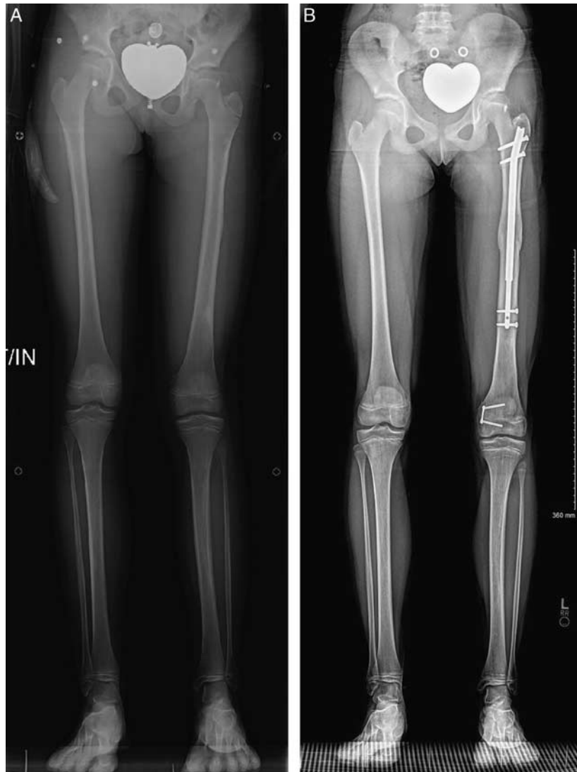
FIGURE 3. A, D.B. is a 12-year-old child with left congenital femoral deficiency, fibular hemimelia, and genu valgus who has previously undergone left femur external fixator lengthening. She had a predicted leg length discrepancy of 3.8 cm at skeletal maturity and underwent left medial distal femur hemiepiphysiodesis and left antegrade femur lengthening with a trochanteric Stryde implant. B, D.B. several months postoperative. Equal leg length and normal alignment achieved.

which the implant was fabricated. There was no corrosion seen in the few nails that were removed during this short study time.