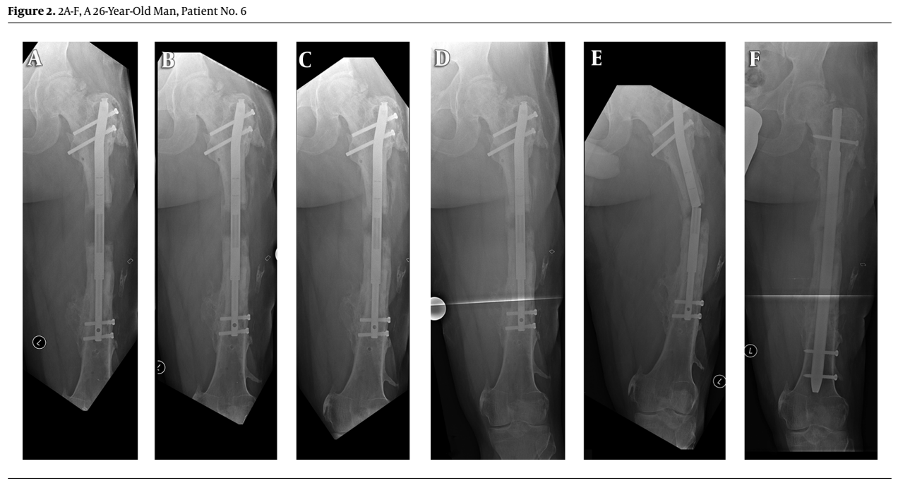
(A-D), AP radiographs show delayed consolidation and shortening of the femur; (E), Breakage of nail after nonunion 10 months after PRECICE implantation; (F), after removal, bone graft and CFN with 1 cm LLD.