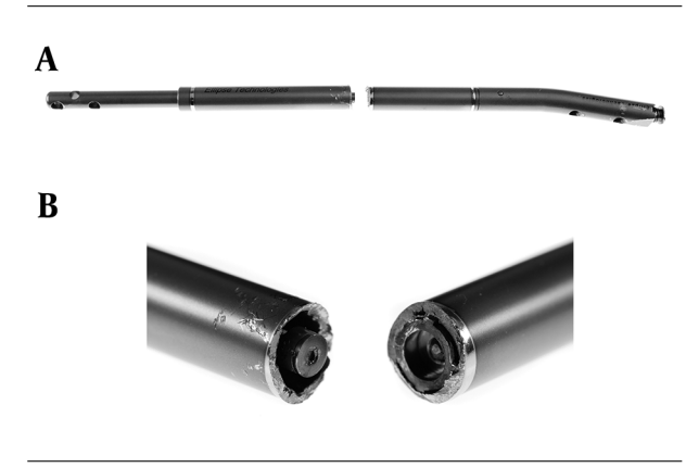
Figure 3. A, B, Nail Breakage in the Middle of the Nail in the PRECICE Nail in the Patient Shown in Figure 2

a prolonged consolidation phase (14, 16, 30). In addition, the weight bearing was likely increased rapidly in this case. Schiedel et al. reported 2 cases of nail breakage during the consolidation in their study of 24 patients. They explained it with increased tension in the nail with the starting consolidation of the bone regenerate or accidental shortening (31).